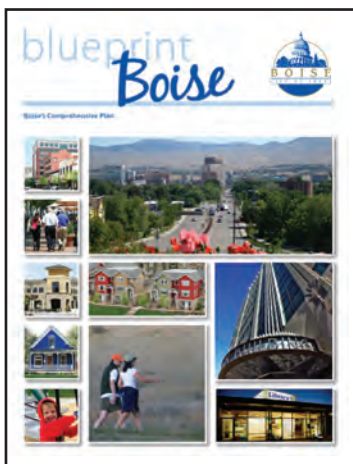
Blueprint Boise is the city's comprehensive plan.