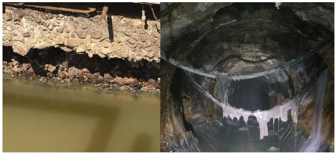
Figure 1 - Examples of degrading water renewal infrastructure. Left degrading concrete at the Lander Street Water Renewal Facility. Right degrading pipe in the collection system

Used water treatment and conveyance requires robust infrastructure and technology that must withstand exposure to harsh conditions and continuous use for decades. These conditions cause the system to degrade over time (see Figure 1). Boise's water renewal system has, thus far, experienced low levels of infrastructure failure as a result of continued investment and maintenance. However, maintaining the aging water renewal system today and into the future will become more challenging.