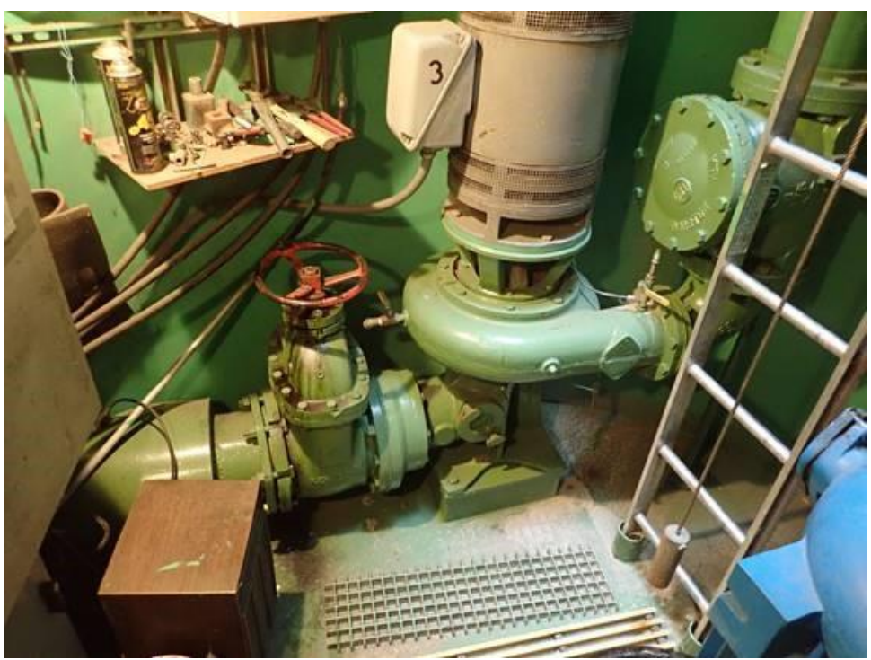
Figure 3 - Regional Lift Station showing one of three pumps. This lift station is critical to the water renewal system and pumps over one million gallons of used water a day and has been in service for over 30 years.

City staff have also been assessing the condition of the collection system, including small-diameter pipe, large-diameter pipe and lift stations. The condition data for small-diameter pipe systems show that 20% (approximately 200 miles) is near the end of its useful life. The condition data for large-diameter pipe systems show that 50% (approximately 30 miles) of the system is nearing the end of its useful life (needing rehabilitation or replacement within the next 10 years). The condition data also demonstrates that three of the regional lift stations (see Figure 3 below) are near the end of their useful lives.